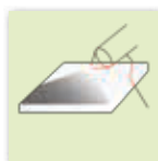
Overlac- quering/ Varnishing