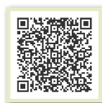
Routing and folding (V-groove cut)